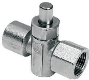
Female Threaded Figur 342